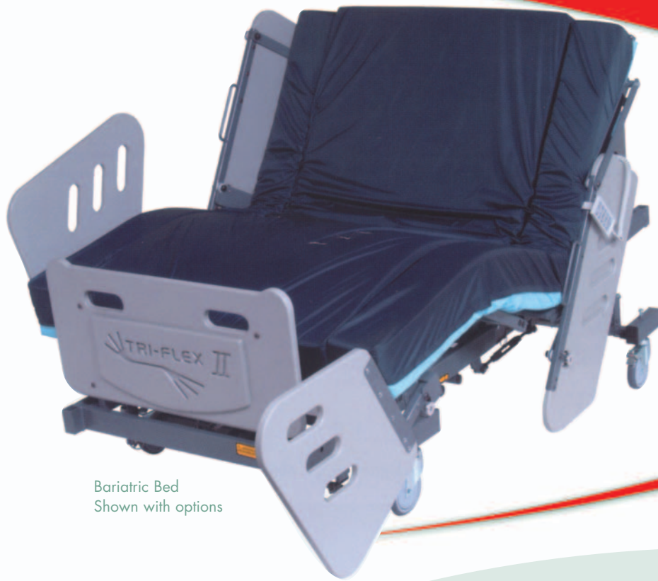
Bariatric Bed Shown with options